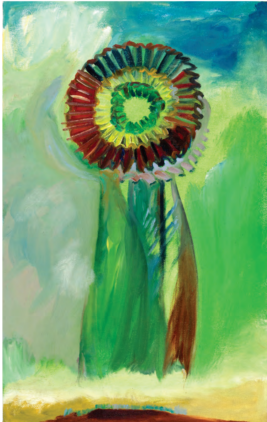
ASHLEY GARRETT, A Day for Fred , 2015, oil on canvas, 16 x 12"