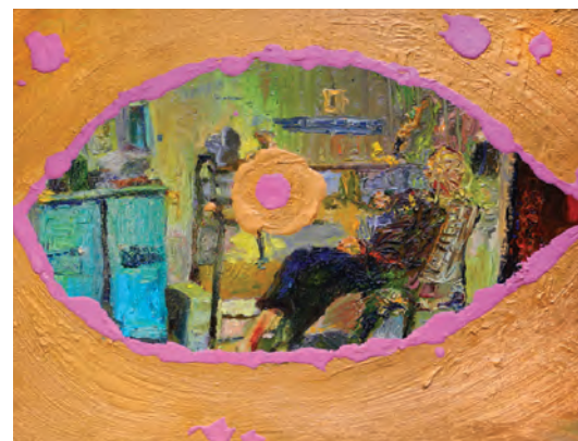
Zach Seeger, Eye (Computer Room) , 2016, oil on canvas, 11 x 16"