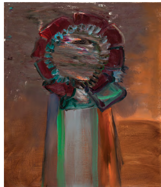
Ashley Garrett, Goblin , 2015, oil on canvas, 14 x 12"