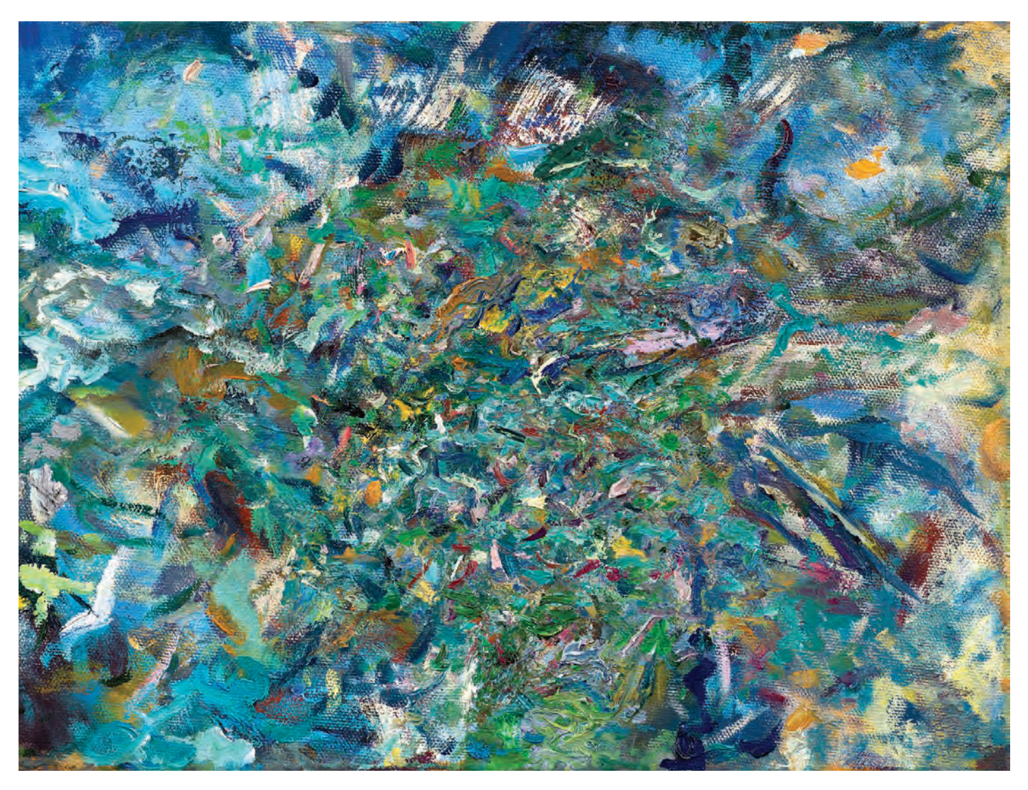
Ashley Garrett Chiral 2021 Oil on canvas 9" x 12"

middle ground energetic markings and tangles of strokes. The larger scale off-white marks sitting on top of and moving across the surface in Umbra push back against all that bristling providing a foil and some temperamental distance by setting up a new spatial level in relation to the color beneath.