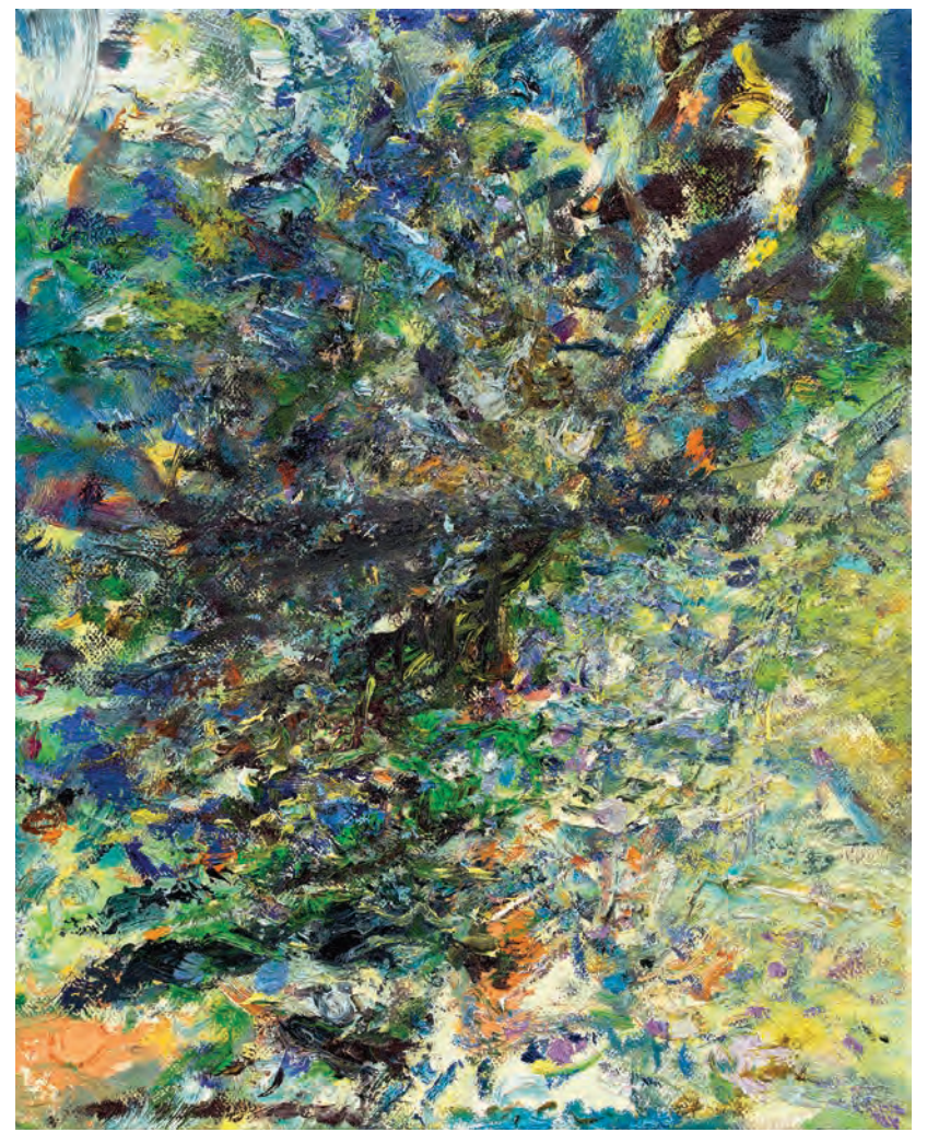
Ashley Garrett, Umwelt 2022 Oil on canvas, 10" x 8"